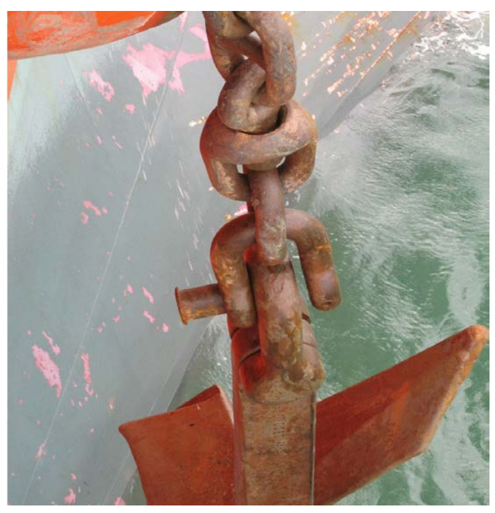
D-shackle bolt coming loose due to detached securing pin

DNV GL, Gard and The Swedish Club have observed a negative trend in loss of anchors and chains and associated costs. A study into the root causes has revealed that a majority of these losses could be avoided by increased awareness of the environmental limitations, more attention to some key technical issues and general good seamanship. This article is a brief summary of the technical issues related to anchor losses.